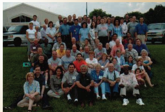
OACI Conference 2004 - Philadelphia USA

If you can't be involved directly, prayerfully consider helping to support an OAC national evangelist, who is reaching his own countrymen for Christ. For details contact one of our offices.