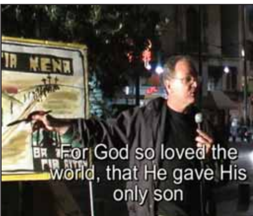
DAN'S EASTER WEEK MESSAGE, 2007