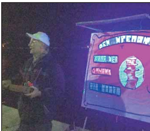
DECEMBER 2019 SHARING AT THE THESSALONIKI SEAFRONT